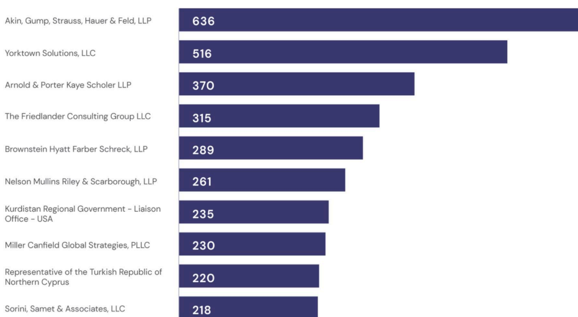
Table 3: Registrants with Most In-Person Meetings

One important reason these lobbying firms are able to attract wealthy foreign clients and facilitate these meetings is the revolving door. Firms such as Akin Gump and Brownstein boast rosters of former government officials, former members of Congress and high-ranking executive branch personnel. The impact of these revolving door lobbyists cannot be understated. One study that examined a large sample of bills in Congress from the 2000s found that “the number of former members of Congress lobbying on those bills had a noticeable impact on the chances of those bills being